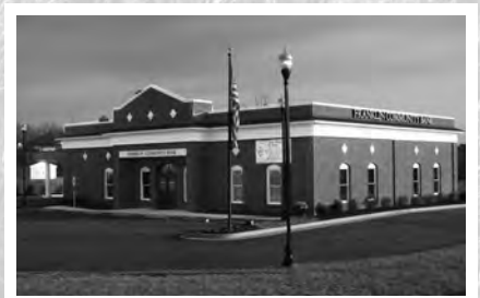
Southlake Office 25 Southlake Drive Union Hall, Virginia 24176 540-576-1218